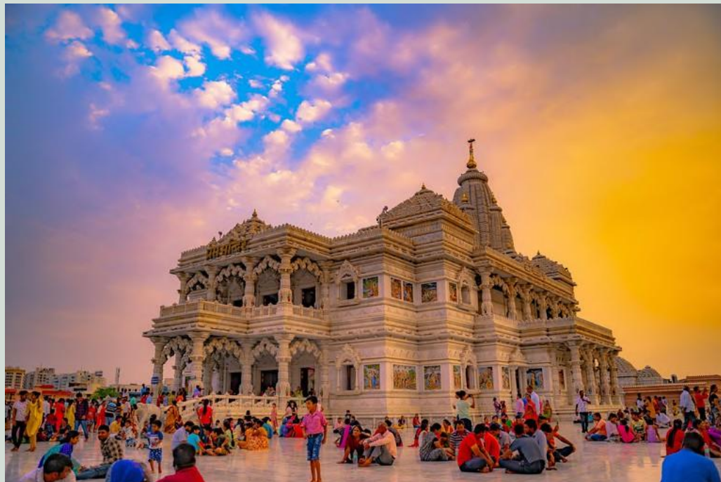
MATHURA & VRINDAVAN

RAM MANDIR one of the biggest cultural sites of India situated in Ayodhya which is at a distance of only 4 hours from Lucknow