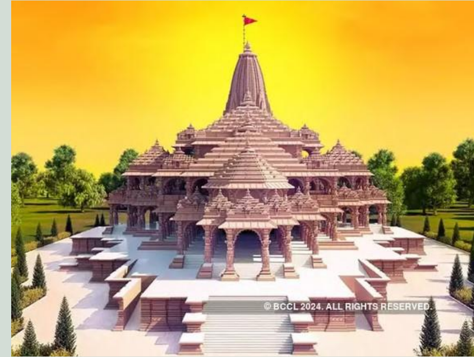
RAM MANDIR, AYODHYA

Visit Tajmahal- one of the Seven wonders which is at the distance of 4 hours from Lucknow (By Roadways)